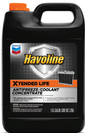
Concentrate 236542, Premixed 50/50 236543