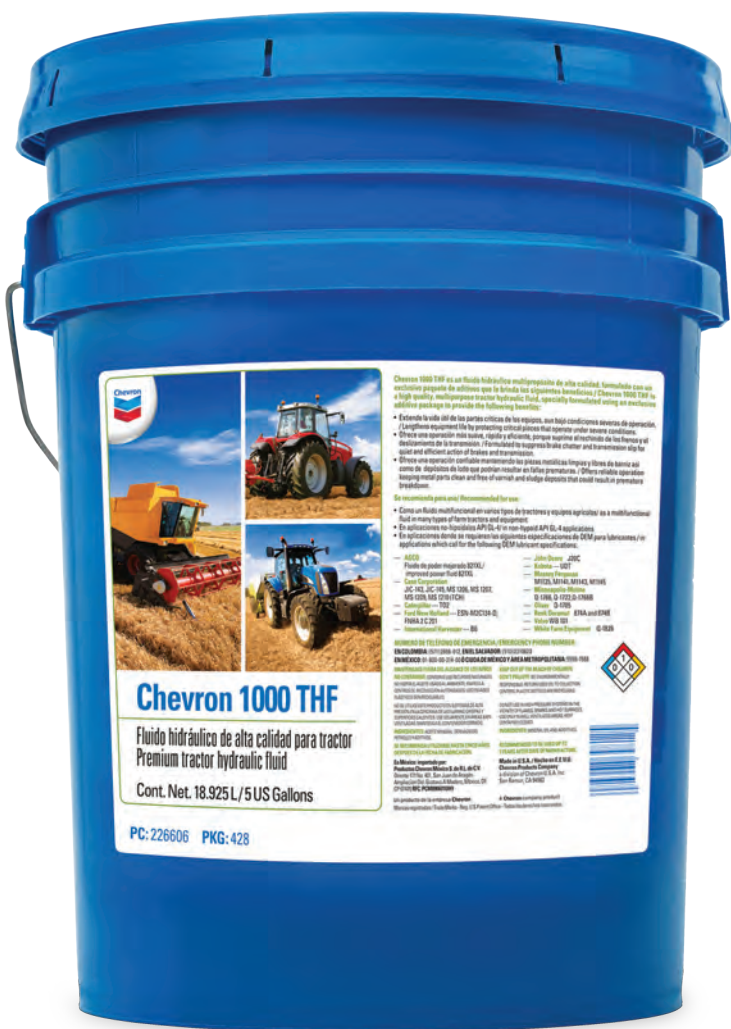
Pail label image for illustration only

Chevron 1000 THF is a high quality, multifunctional tractor hydraulic fluid, specially formulated for use in transmissions, final drives, wet brakes and hydraulic systems of tractors and other equipment employing a common fluid reservoir.